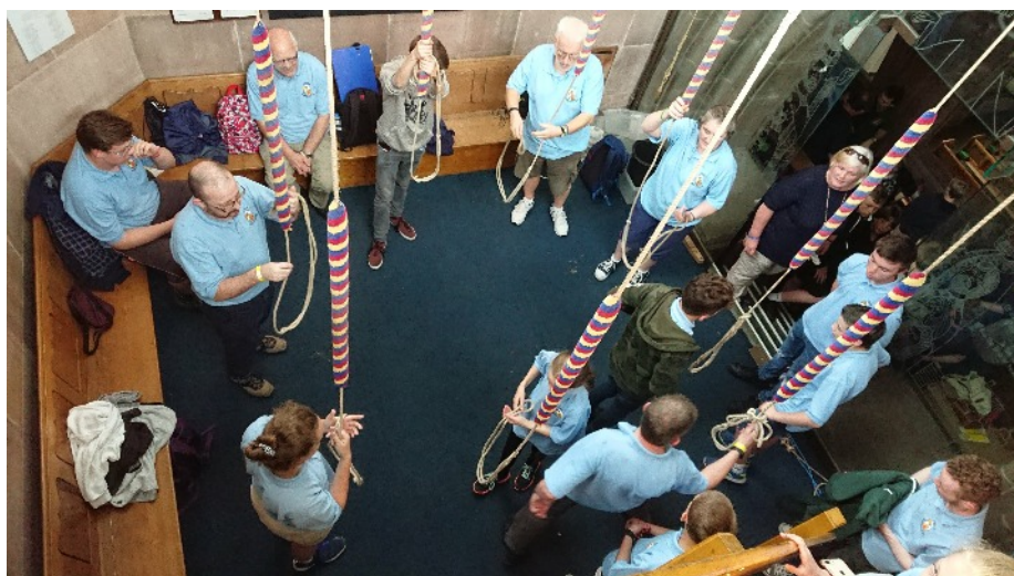
'Walton on the Hill'