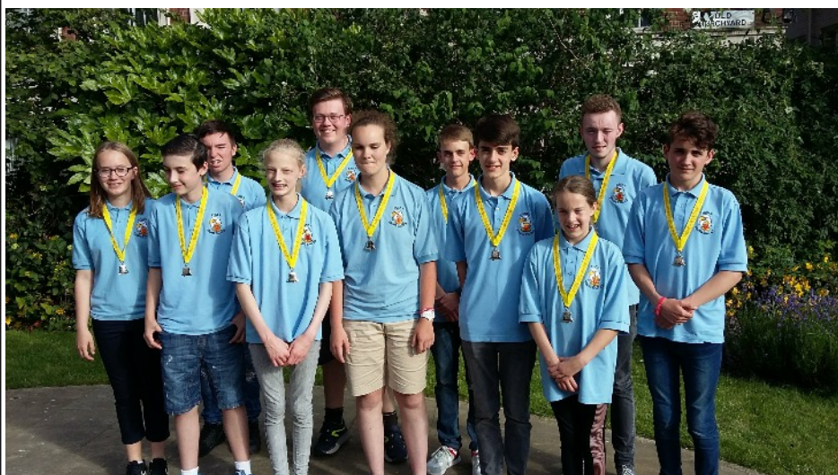
'The Essex Young Eagles outside Pier Head with their medals'