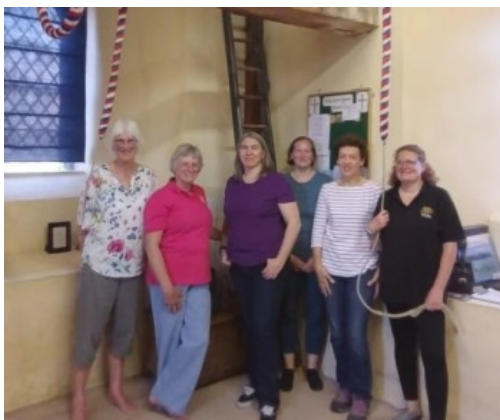
Band in order left to right