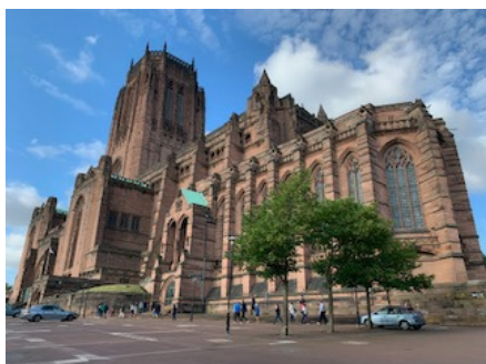
Liverpool Cathedral