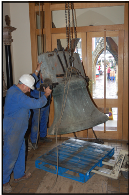
The first bell being lowered, the Tenor

The Bell Restoration Appeal started last year and got underway on Thursday 1st & 2nd June 2007 which saw the removal of the peal of eight bells, since 1922.