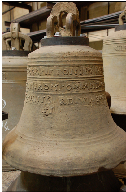
The 2 nd bell after being cleaned

have been removed while cast insulation pads have been made for the crowns of each bell. Four supporting bolt holes were drilled in the crowns and then turned to present a new surface for the blow of each clapper. New metal headstocks will now replace the worn elm headstocks.