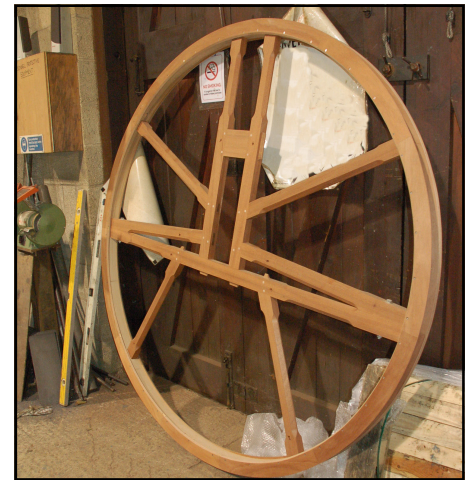
The new hardwood wheel for the tenor

The cost of this restoration is in excess of £35,000.