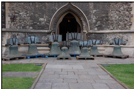
All eight bells on display outside the church

on display for all to see before they were transported to the workshop of Whites of Appleton in Oxford for essential work, that will ensure that full circle ringing can continue in Romford for many years to come. Shortly after arriving to Whites of Appleton the bells were taken to the